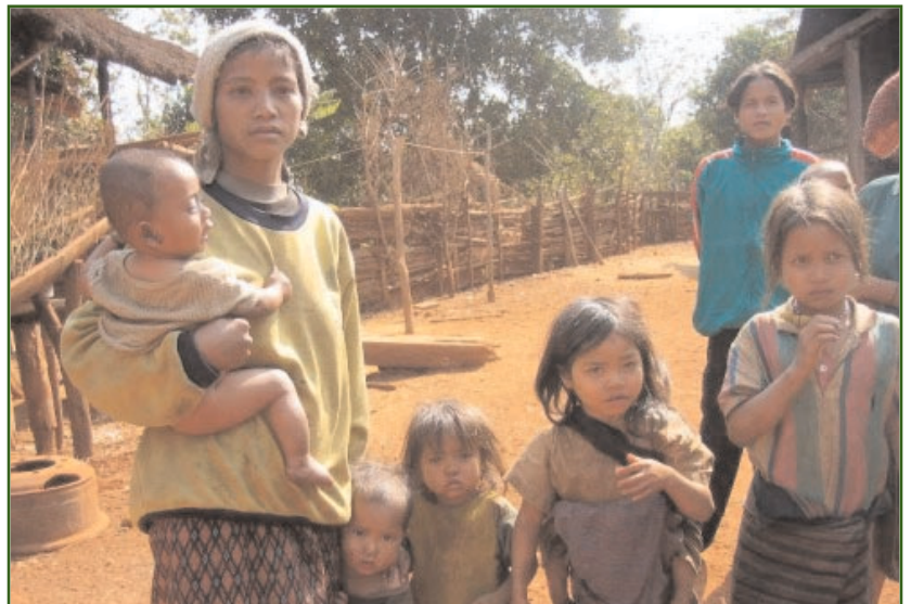
Affected families benefiting from social and medical rehabilitation services in Laos.