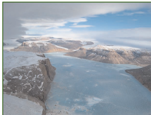
Photograph of Greenland mountains

After the Sagax-Revo expedition to Greenland in July 2007, Green Cross France will soon embark on the Ambassadors for the Arctic expedition.