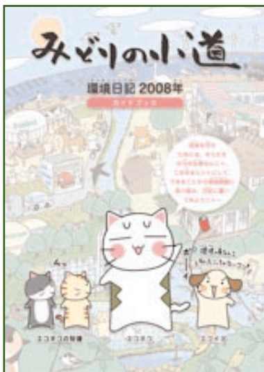
Cover of Green Lane environmental diary.

The program is passed on from students to younger siblings and students every year. The city of Kitakyushu and the Shinjyuku municipality of Tokyo have further adopted this program to cover all the elementary schools in their area.