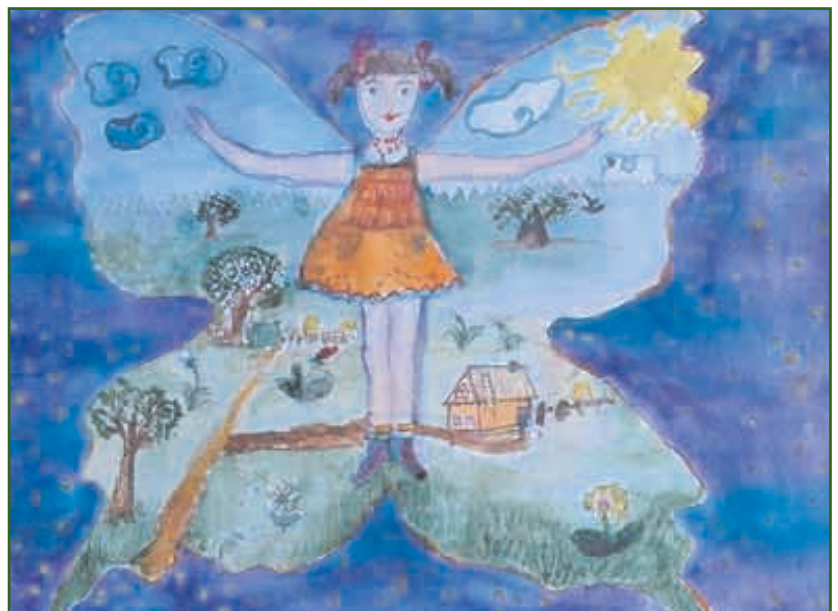
International jury selects drawings for awards and exhibit. To date 55,000 drawings are registered.