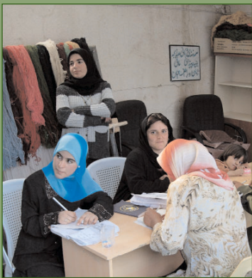
A women's education centre in Halabja.

GC Switzerland and Société pour les peuples menacés commemorate the 20 th Anniversary of the Halabja massacre in Northern Iraq. The town of Halabja is home to victims of Saddam Hussein's use of illegal chemical weapons. Today, Halabja